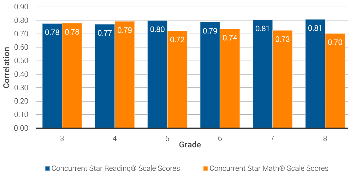
Figure 1. Star Reading and Star Math scores highly correlate with Mississippi Academic Assessment Program (MAAP) Tests